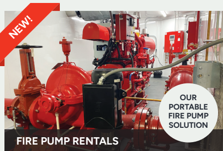
FIRE PUMP RENTALS