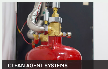
CLEAN AGENT SYSTEMS