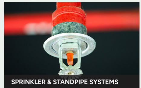
SPRINKLER & STANDPIPE SYSTEMS