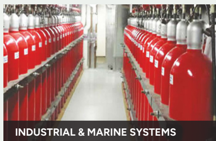
INDUSTRIAL & MARINE SYSTEMS