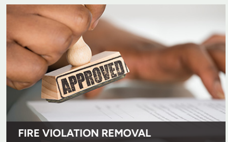
FIRE VIOLATION REMOVAL